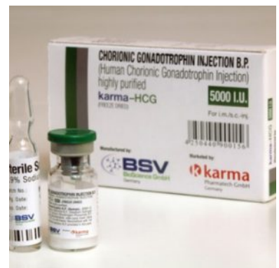
High Quality HCG 5000IU in USA