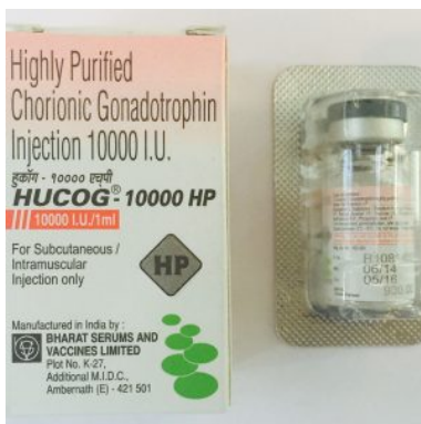
High Quality HCG 10000IU in USA