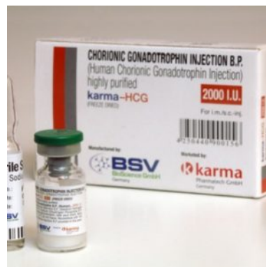
High Quality HCG 2000IU in USA