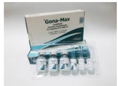
High Quality Gona-Max in USA